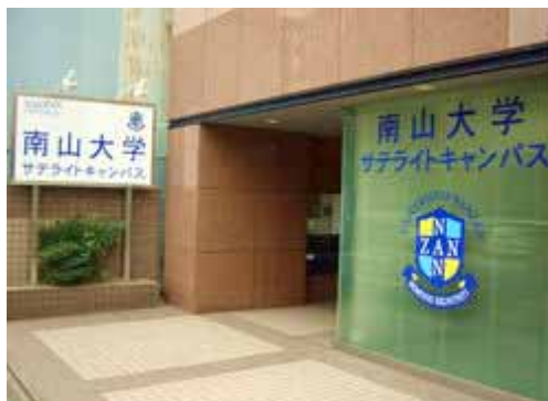
Entrance of Nagoya(Takaoka) Satellite Campus

Telephone of the satellite campus: 052-939-3380